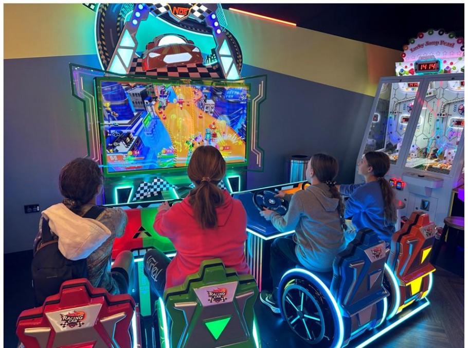
Gr 4-6 Canberra Camp 2024